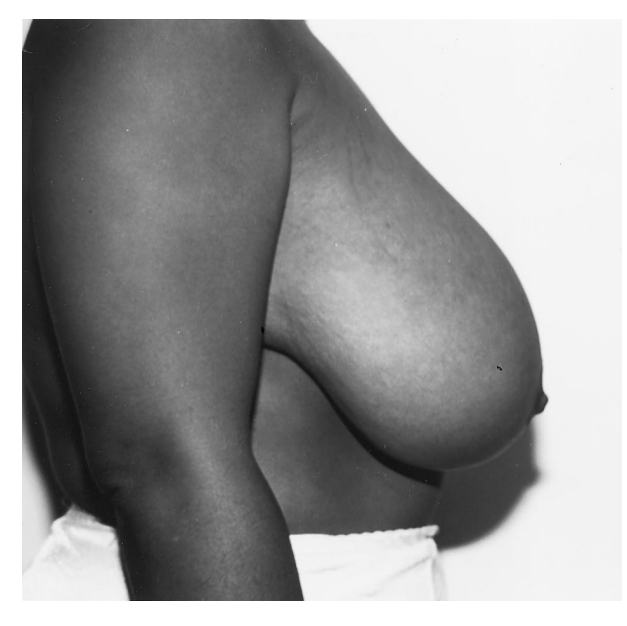
Fig 2. Preoperative lateral view.

Postoperative viability and sensation of the NAC was based on physical examination and response to sensory testing. Viability was documented as total necrosis, partial necrosis, and no necrosis. Sensation was based on response to light touch in all 133 breasts, and quantitative sensory testing using the pressure-specified sensory device (PSSD) in 33 breasts.<sup>26</sup> This is a computer-assisted device that functions in principle much like the Semmes–Weinstein mono-filaments; however, it differs in that it has a