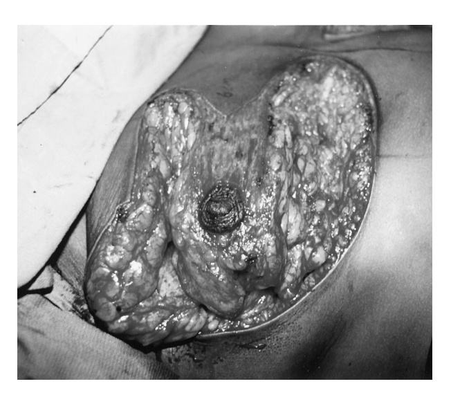
Fig 6. The medial pedicle is in its natural position.

greater sensitivity. The PSSD is capable of detecting sensory thresholds of 0.3 g per square millimeter, whereas the Semmes–Weinstein filaments are sensitive to 2.0 g per square millimeter. Subjective sensation of the nipple and the areola was graded as completely present, partially present, or absent. Objective sensory testing of the nipple and areola using the PSSD included response to one-point moving and static touch. Preoperative normative data using the PSSD were not obtained. However, postoperative data were compared with control women with moderate to