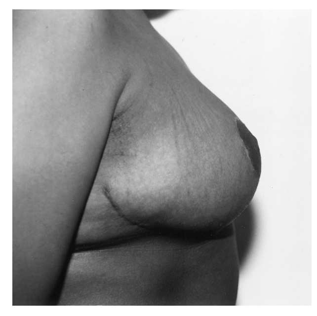
Fig 10. Postoperative lateral view demonstrating excellent projection and contour.

were unilateral, totaling 54 breasts. Mean patient weight was 156 lb (range, 118–205 lb) and mean height was 5'4" (range, 4'10"–5'8"). The variables requiring evaluation for each breast included the