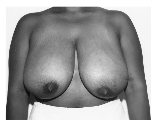
Fig 1. Preoperative view of a 27-year-old woman. She is 5'4" tall and her body weight is 180 lb. Her bra size is 42DD. The distance from the sternal notch to the nipple is 36 cm on the left and 34 cm on the right. The distance from the nipple to the inframammary fold is 17 cm bilaterally.

The degree of mammary hypertrophy has been defined arbitrarily for this study. Mild hypertrophy is defined as NAC elevation less than 10 cm and a resection weight of less than 600 g per breast. Moderate hypertrophy is defined as NAC elevation between 10 and 15 cm and a resection weight between 600 and 1,200 g. Severe mammary hypertrophy is defined as NAC elevation more than 15 cm and a resection weight more than 1,200 g. The inferior pedicle was chosen for women with mild to moderate hypertrophy because it was felt that the vascularity and innervation would be sufficient. In cases of severe mammary hypertrophy, the medial pedicle was used because of the advantages related to vascularity and innervation. The free nipple graft technique was used only when converting from a pedicle technique.