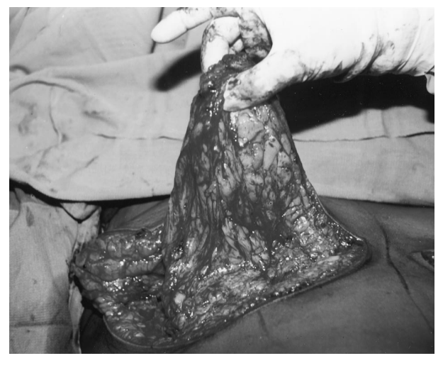
Fig 5. The medial pedicle is elevated. It is a dermoparenchymal pedicle with its blood supply originating from the internal mammary perforators and the intercostal/pectoral perforators.