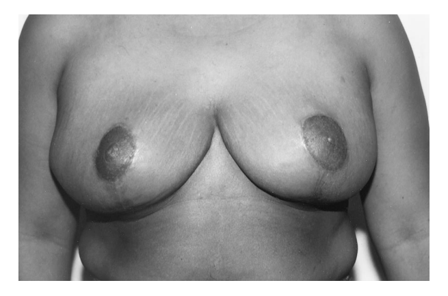
Fig 9. Postoperative view at the 1-year follow-up. The nipple–areolar complex is viable and sensate bilaterally.

were unilateral, totaling 54 breasts. Mean patient weight was 156 lb (range, 118–205 lb) and mean height was 5'4" (range, 4'10"–5'8"). The variables requiring evaluation for each breast included the