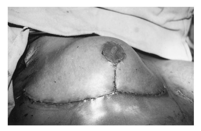
Fig 8. The weight of resected tissue was 1,250 g on the right and 1,315 g on the left. The nipple is pink and viable after the procedure.