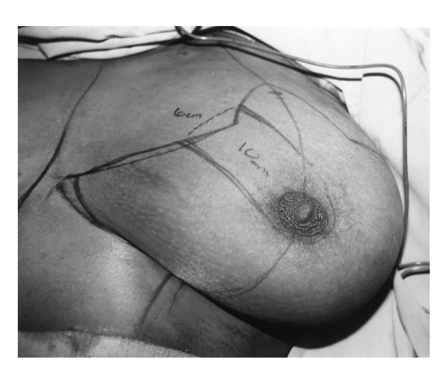
Fig 4. The medial pedicle is outlined in the supine position. The base of the pedicle is 6 cm and the length of the pedicle is 10 cm.

greater sensitivity. The PSSD is capable of detecting sensory thresholds of 0.3 g per square millimeter, whereas the Semmes–Weinstein filaments are sensitive to 2.0 g per square millimeter. Subjective sensation of the nipple and the areola was graded as completely present, partially present, or absent. Objective sensory testing of the nipple and areola using the PSSD included response to one-point moving and static touch. Preoperative normative data using the PSSD were not obtained. However, postoperative data were compared with control women with moderate to